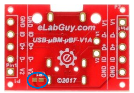
Figure 6: PCB back with optional Jumper connects Shield to GND