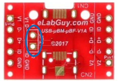
Figure 5: PCB front with open circuit on VCC pin in series