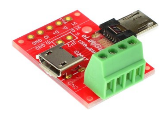
Figure 4: USB-uBM-uBF-V1A with terminal blocks