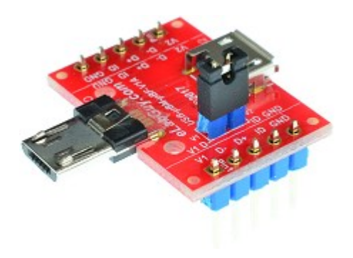
Figure 3: USB-uBM-uBF-V1A with headers