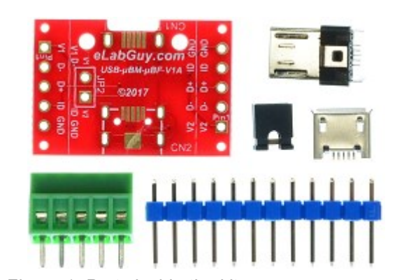
Figure 1: Parts inside the kit (Note: the module is not assembled, user can decide which connector to use on the module.)